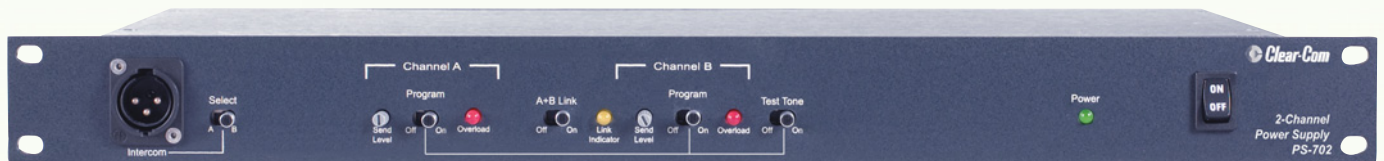
PS-702 Front view

The PS-702 can supply up to 2 amps at 30 volts DC to two channels in a 1-RU. This is sufficient to power up to 40 belt packs, 10 speaker stations, or 12 headset stations even under the most demanding conditions. Either channel is capable of supplying up to 1.2 amps. The full current capacity may be divided between the two channels.