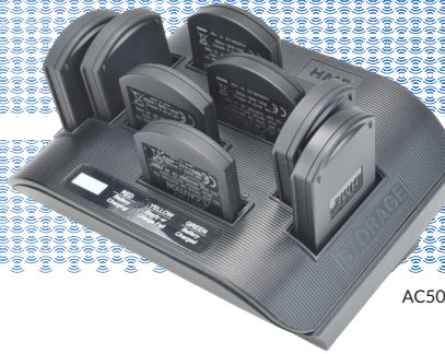
AC50 Battery Charger